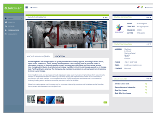
Supplier profiles and mapping