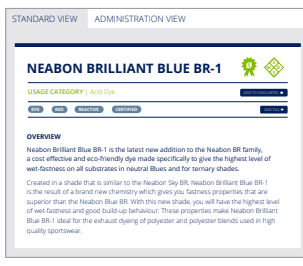
Chemical inventory monitoring